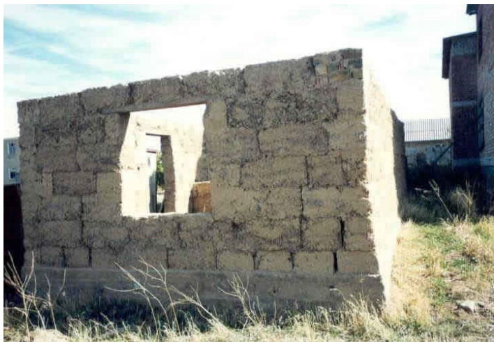
An Illustration of Key Seismic Features and/or Deficiencies

Additional comments section 3 This is a traditional type of construction which had been practiced before the introduction of building codes. As this is a non-engineered construction, current building codes do not address this type of construction.