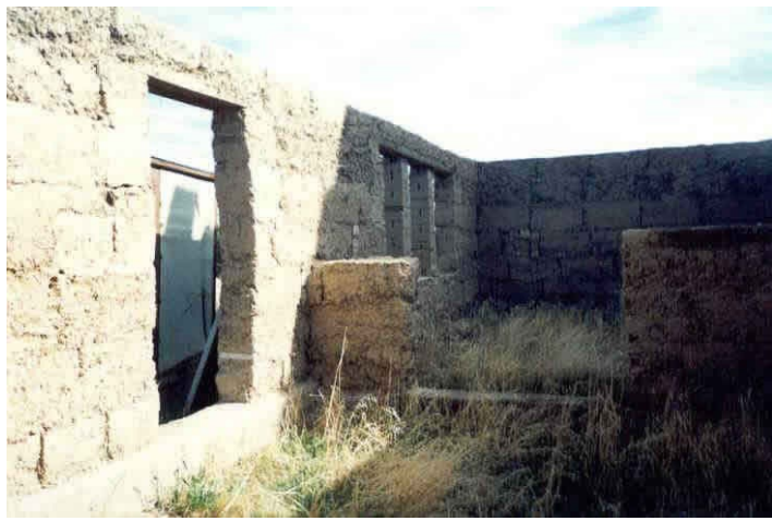
Illustration of Key Seismic Features